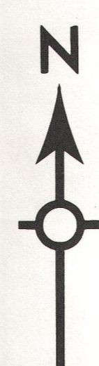
ROOSEVELT HOT SPRINGS KGRA THERMAL GRADIENT CONTOUR MAP GRADIENTS FROM 60-100 METERS CONTOUR INTERVAL 100°C/KM