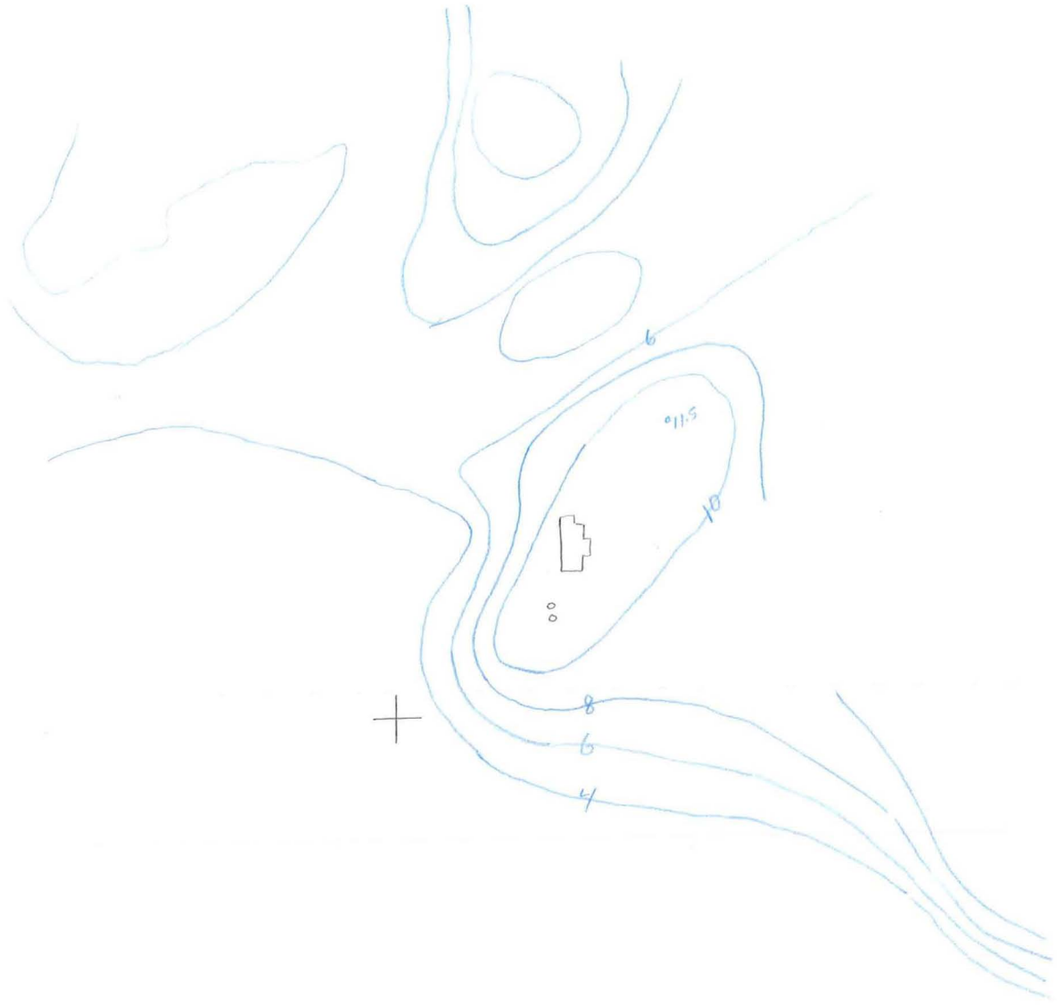
Geothermal Gradient Map from (Doss, 1975)