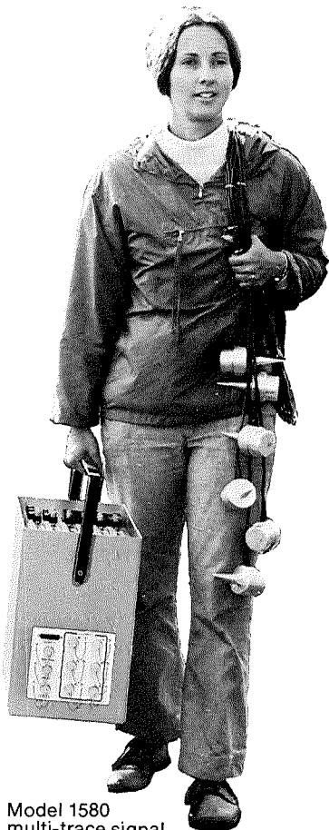
Model 1580 multi-trace signal enhancement seismograph.